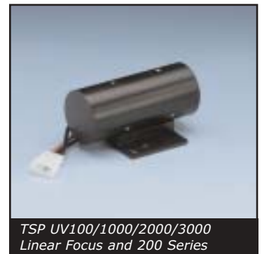
TSP UV100/1000/2000/3000 Linear Focus and 200 Series