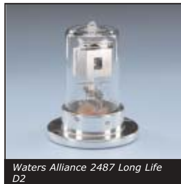
Waters Alliance 2487 Long Life D2