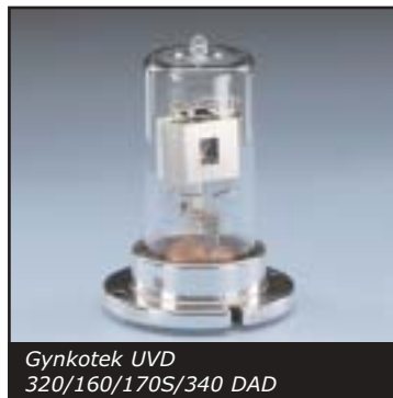
Gynkotek UVD 320/160/170S/340 DAD