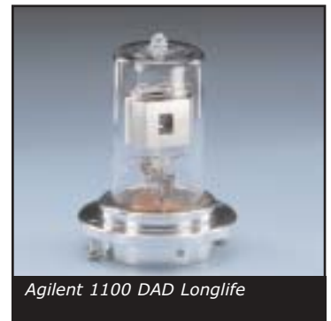
Agilent 1100 DAD Longlife