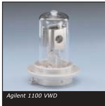
Agilent 1100 VWD