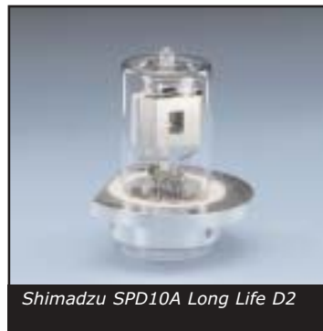
Shimadzu SPD10A Long Life D2