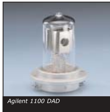
Agilent 1100 DAD