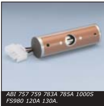
ABI 757 759 783A 785A 1000S FS980 120A 130A.