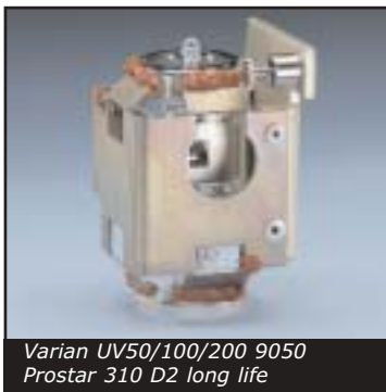
Varian UV50/100/200 9050 Prostar 310 D2 long life