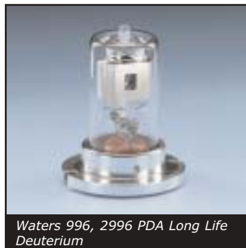
Waters 996, 2996 PDA Long Life Deuterium